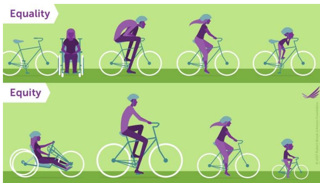
Figure 3: www.rwjf.org/content/dam/images/unrestricted-use/infographics/RWJF_bikes_equality_equity_PURPLE.jpg