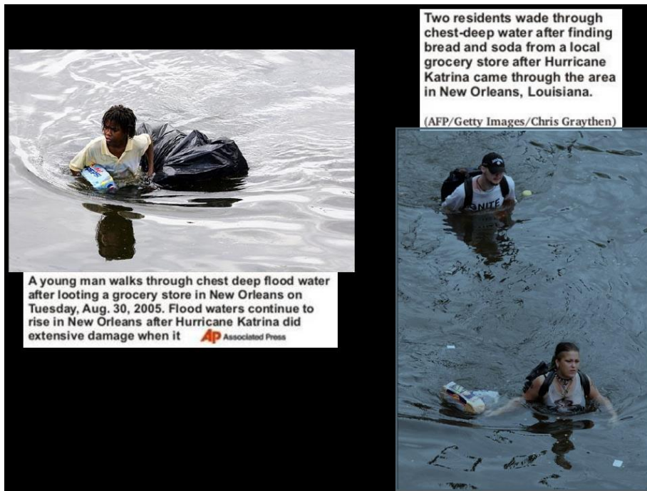
Figure 6: Dane County MAC presentation (Madison, WI; December 5, 2014)

Implicit Bias Assessment: https://implicit.harvard.edu/implicit/